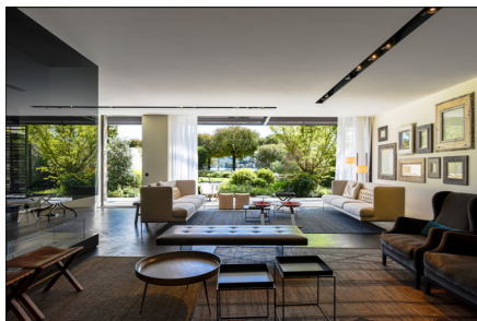
The lounge is at the heart of the house and is the perfect spot to relax and unwind