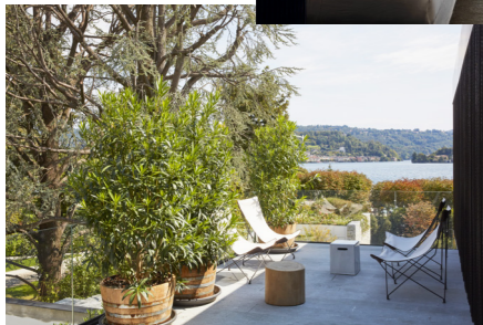
Casa Fantini has 11 rooms, some with private terraces (above), which all overlook the lake