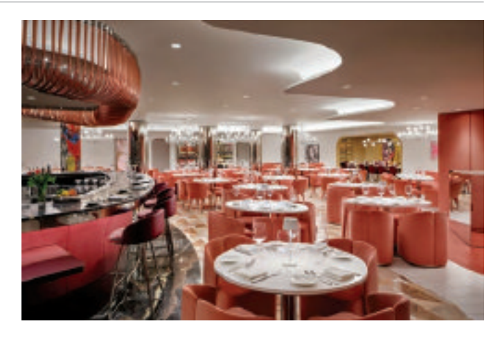
SOFIA DESIGN DISTRICT 140 NE 39th St. #133, Miami