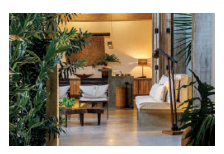
CASA MIA Trancoso, Brazil

Part of the Casas Latinas hotels and villas collection and designed by Brazilian architect Maristela Gorayeb, Casa Mia is a five-bedroom contemporary hideaway, full of natural light and surrounded by abundant tropical gardens. A spacious living area opens up to a stone terrace with views over the gardens and a contemporary black stone infinity pool. An on-site dedicated team with experienced concierges and a private chef will look after your every need.